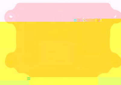
CYCR-3 重型共轨 ECU CYCR-3 heavy duty common rail ECU