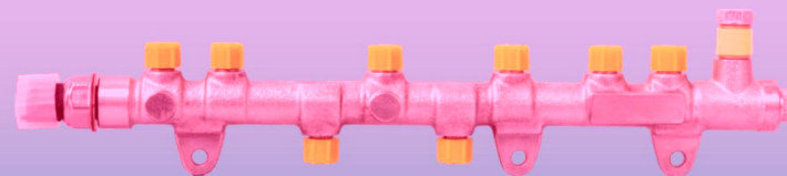
CYCR-3 重型共轨管 CYCR-3 heavy duty common rail