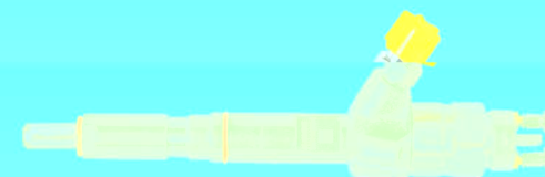
CYCR-2中型共轨喷油器 CYCR-2 medium duty common rail injector