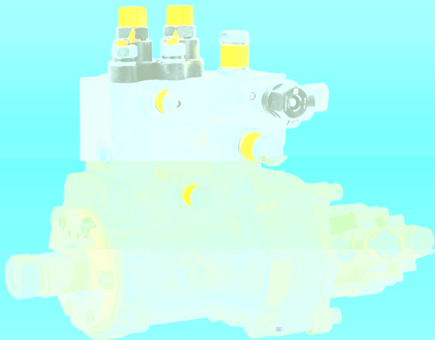
CYCR-2中型共轨泵 CYCR-2 medium duty common rail pump