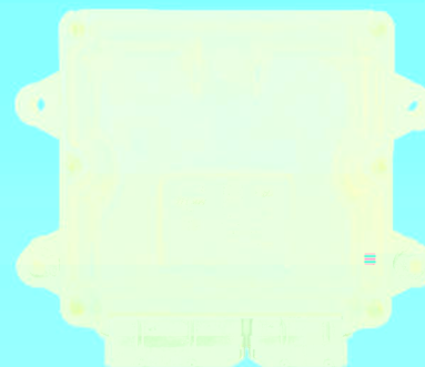
CYCR-2中型共轨ECU CYCR-2 medium duty common rail ECU